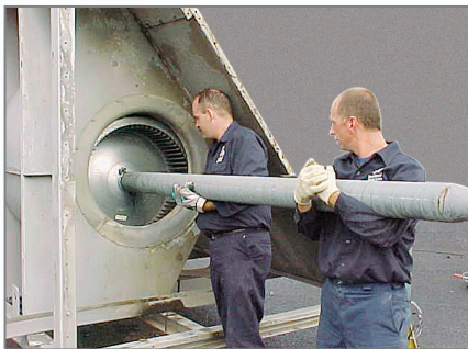
Fans and Shaft Kits