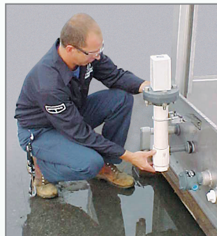
Electrical Water Level Controls