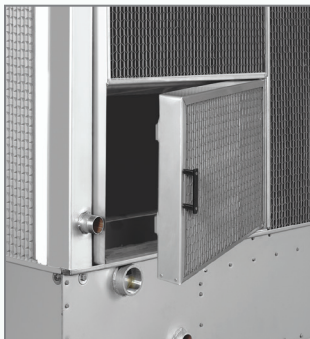
Louver Access Door