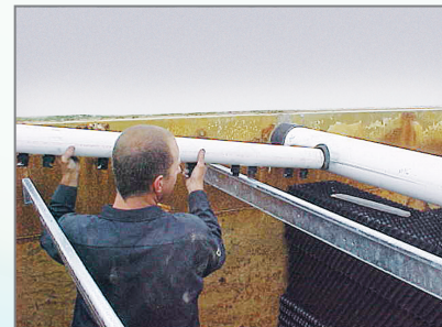
Water Distribution Systems and Counterflow Fill

Mr. GoodTower Service Centers will evaluate existing equipment layouts and recommend replacement units.