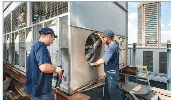
Shaft Inspection and Bearing Lubrication

Mr. GoodTower Service Centers stock parts for emergency repairs!