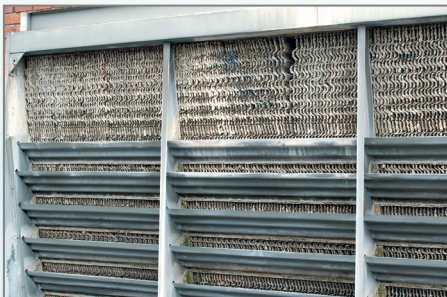
Old, Inefficient, Damaged Fill