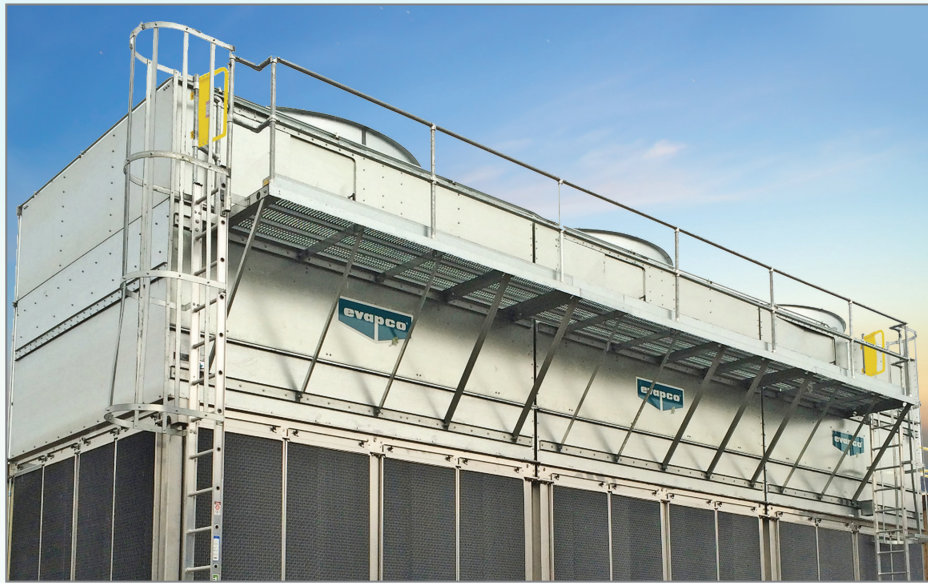
Custom Platforms and Ladders