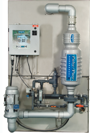
Pulse~Pure Non-Chemical Water Treatment System