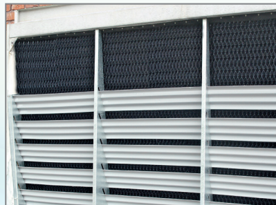
Mr. GoodTower High Efficiency Fill